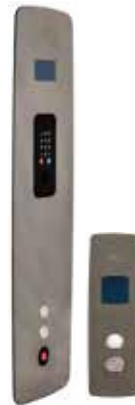
Bronze Mirror Glass