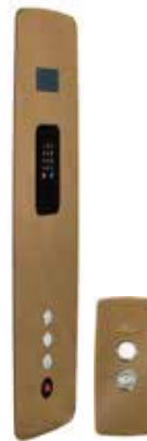
Champagne Mirror Glass