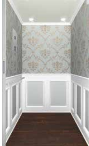
Design It Yourself / MDF Walls (Optional)