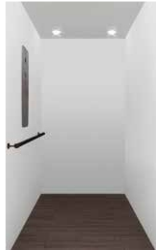
Melamine Panel (Optional)