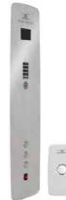
Polished Stainless Steel (Mirror)