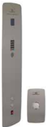
Brushed Stainless Steel