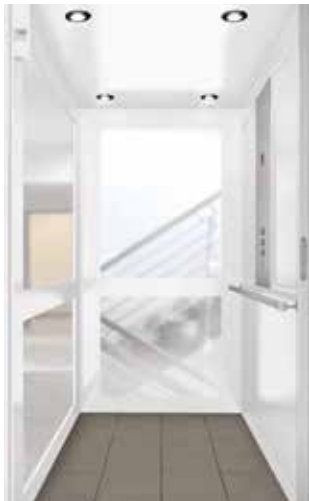
Aluminum and Glass Panel (Upgrade)