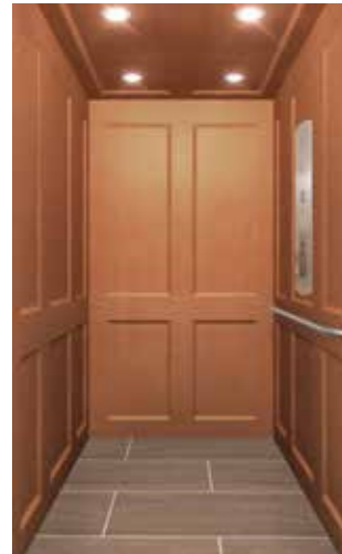
Recessed Panel* (Upgrade)