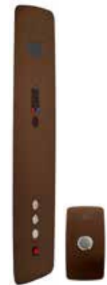
Oil Rubbed Bronze