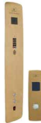
Polished Gold (Mirror)