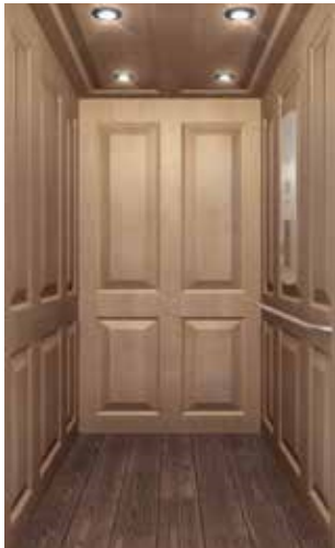
Raised Panel* (Upgrade)