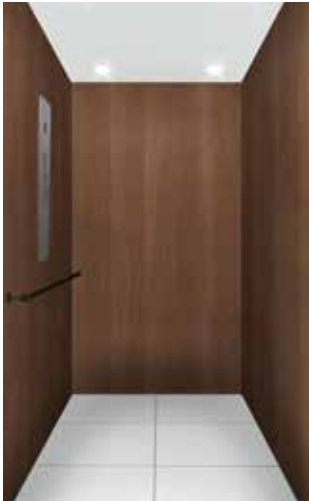
Veneer Panel (Standard)